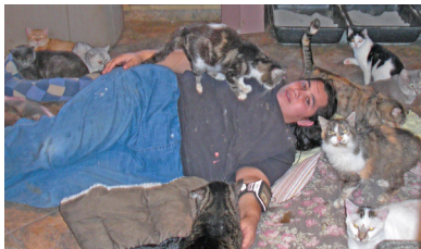
Lunch break with friends